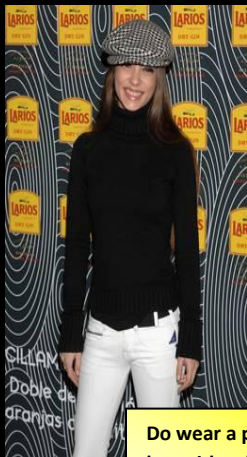
Do wear a print hat with solid clothing