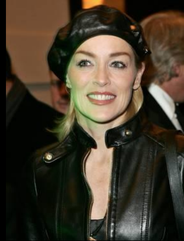
Don't wear matchy-matchy