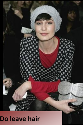
Do leave hair showing when wearing a knit hat