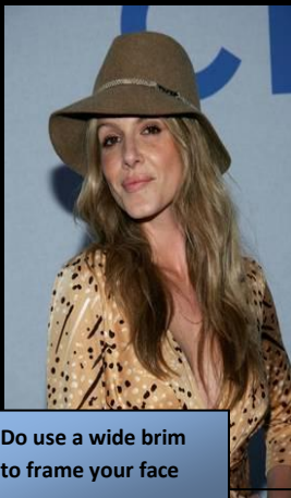
Do use a wide brim to frame your face

But, there are rules when it comes to donning one's chapeau, so pay attention!